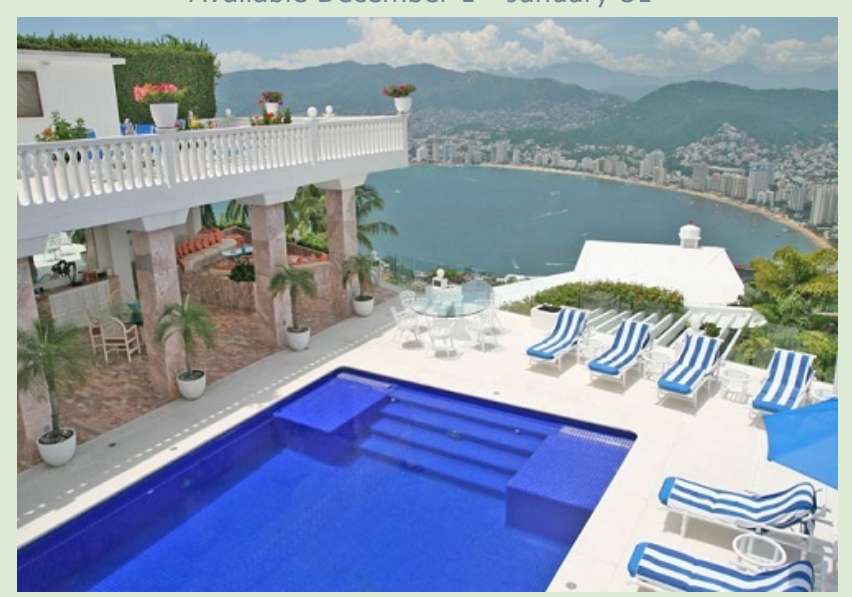
Aix-en-Provence, France T1461