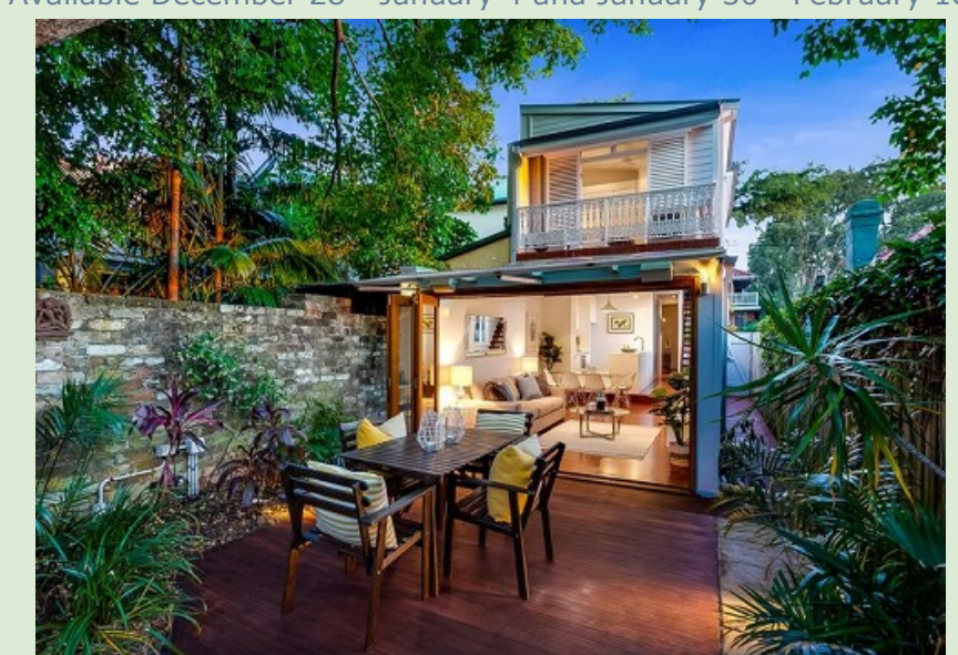
Snow Dance Haven Deer Valley, Utah <u>T2165</u>

T3122 Available December 28 - January 4 and January 30 - February 18