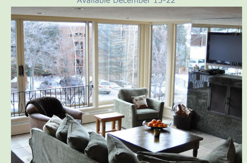
The Hemingways Private Residence Club Sun Valley, Idaho T2880 Available March 29 - April 5