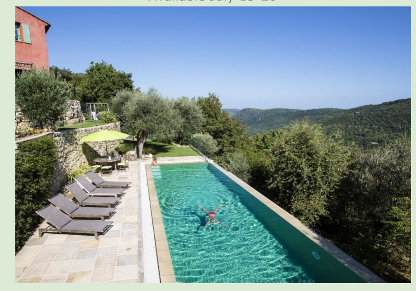
Catalina Foothills Estate Tucson, Arizona

T3262 New to Trade to Travel! Available July 13-20